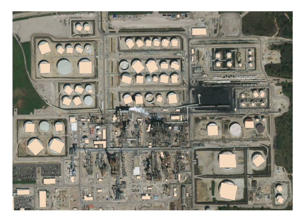
Figure 4. LP360 extraction: A sample dataset from Will County, Illinois