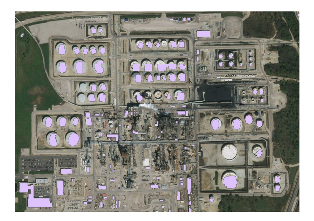
Figure 5. Microsoft building footprints: A sample dataset from Will County, Illinois