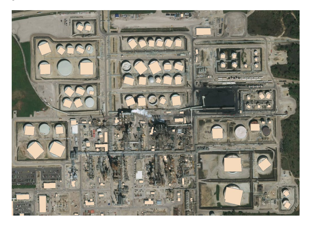
Figure 2. A sample dataset showing errors from squaring buildings from Will County, Illinois