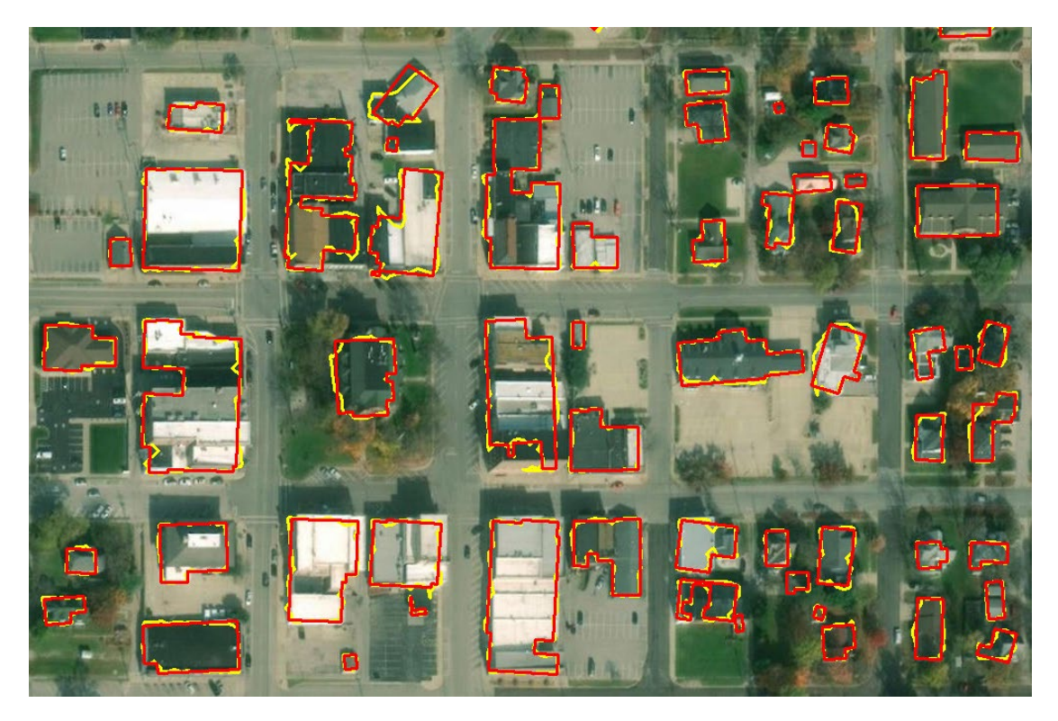
Figure 3. A sample area from Bond County, Illinois showing buildings before and after applying the squaring function in LP360

Microsoft developed a method that approximates the prediction pixels into polygons, making decisions based on the whole prediction feature space. This process is different from the LP360 extraction method. Results obtained from LP360 had to be smoothed to decrease the occurrence of noisy points near the building edges. This was performed using the squaring function, which produces smoother and neater polygons of buildings by squaring the traced outlines (Figure 3).